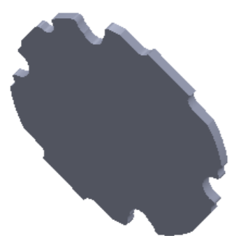
3D View Scale:- 2:1